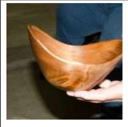
Bob Eberhardt with winged bowls and a blue stained maple bowl.