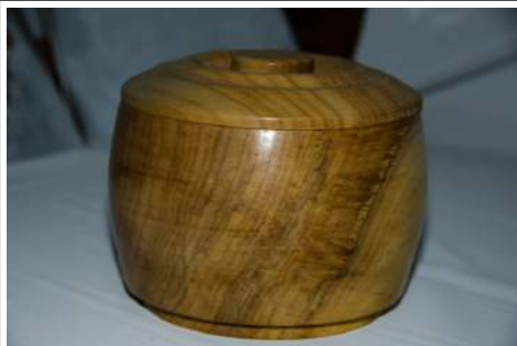
Dick Prouty Lidded Cookie Jar