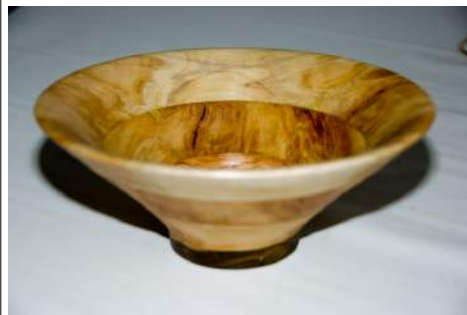
Joe Nycz Poplar Bowl with Red Figure