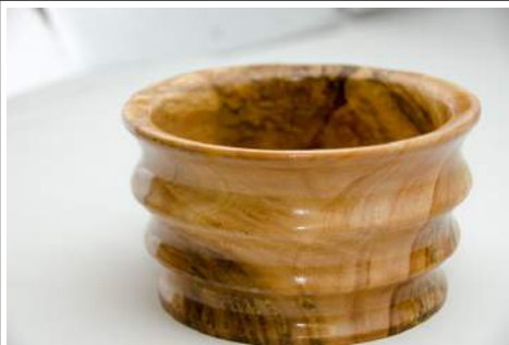
Laverne Schulz Bowl