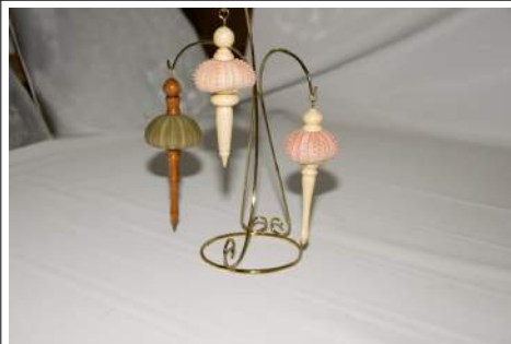
Dick Prouty Sea Urchin Ornaments