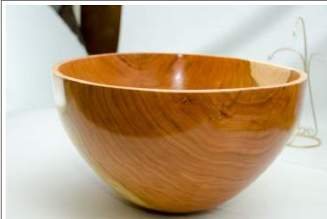
Barry Grille Large Cherry Bowl