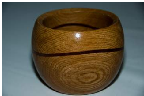
Rich Thelen Wave Bowl