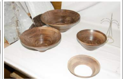
Joe Nycz Series of Split Ring Bowls - nest from same board