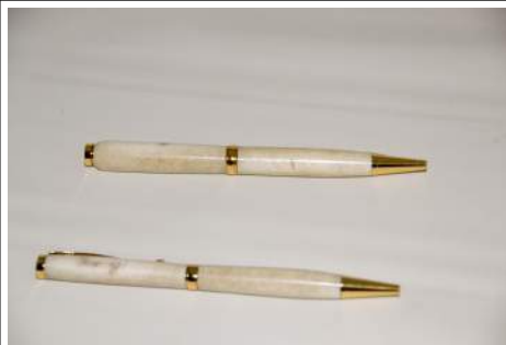
Dick Prouty Turned Bone Pens