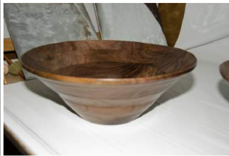
Joe Nycz 14.5 " Split Ring Black Walnut bowl