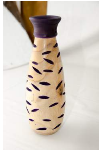
Jeff Fagan Purple Dye, Angle Grinder