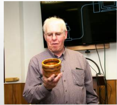
Al Otto—Segmented Bowl