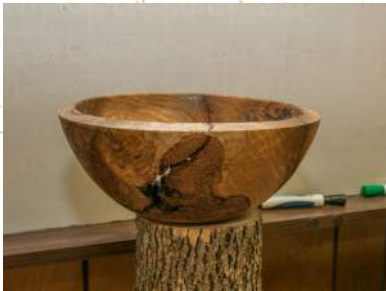
Rich Thelen- Catalpa Bowl