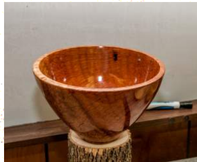
Rich Thelen—Redwood Burl