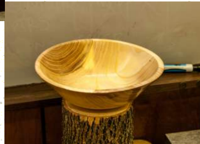
Marc Palma—Ash Symet- rical Grain