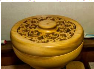
Bill Freeman—Scrolled Lidded Box