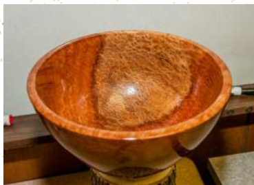
Randy Patzke - Redwood Burl