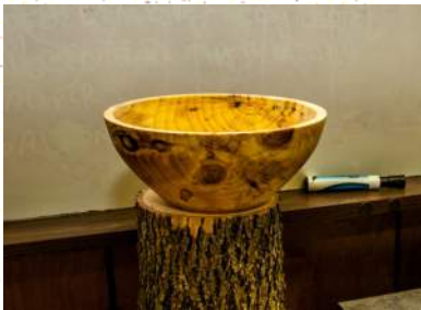
Unlisted -Norfolk Pine