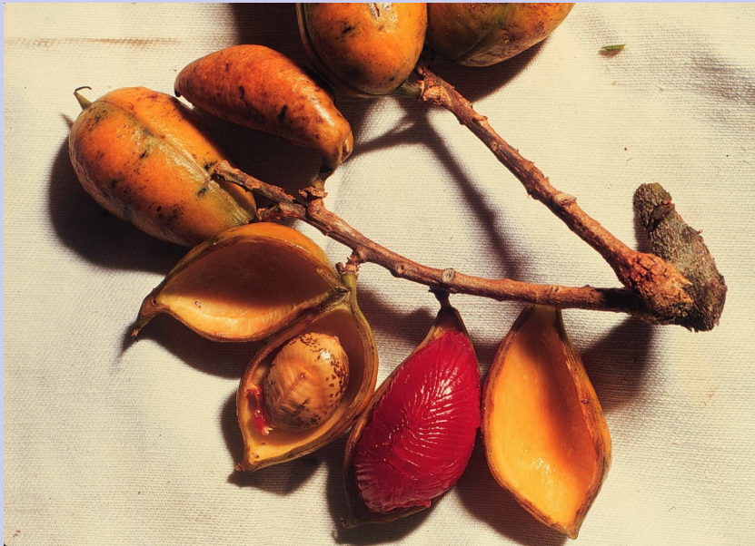
Above: Fruit of the Queenwood tree. Below: Sapwood and hardwood carved statues of the Queenwood tree.